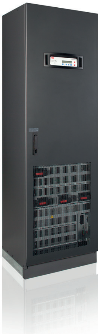
PowerWave 33 S3 60 - 120 kW